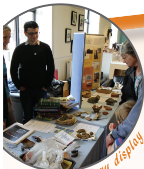
OSHG pottery display