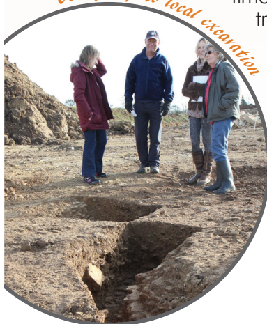
OSHG trip to local excavation

Old Place, Sleaford lies at the heart of over two thousand years of history. A number of excavations from the 1960s onwards have recovered evidence which demonstrates that from around 50BC and up to the Roman invasion in AD43, the inhabitants of Sleaford were already minting coinage and importing continental pottery. Archaeologists believe that at this time Sleaford was a sub-capital of the local Iron Age tribe, the Corieltauvi.